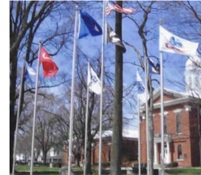
Flags of all the military services fly throughout the year over the Veterans Memorial at the Courthouse Square in La Grange.

Members also get the benefit of satisfaction by recognizing the service of others and helping them and their families remember that service and the freedom it offers to all citizens of the United States of America.