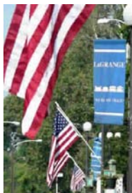
Avenue of Flags in La Grange

Flags are placed on Veterans' graves at all the cemeteries in Oldham County for Memorial Day. Each year Legion members volunteer to place the flags in Oldham County.