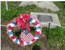
Veterans Memorial Wreath—2008

The Avenue of Flags in La Grange is sponsored by The American Legion with support from the city of La Grange. Flags fly from Memorial Day to Veterans Day.